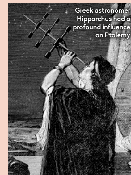
Greek astronomer Hipparchus had a profound influence on Ptolemy

Unfortunately, his original work is lost to history, and we only know of it through later writers such as Ptolemy. Instead, he has lunar and Martian craters and